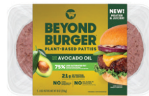
Beyond Beyond Burger

Our plant-based meats are made with intention. We combine expert innovation with simple, non-GMO ingredients to deliver the meaty experience you crave without the compromise. Did we mention that each of our products is a good source of protein? It's true. Plus, there's 0mg of cholesterol, and no added antibiotics and no hormones. Pretty great, huh?