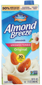
Almond Breeze Almondmilk selected varieties