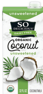
So Delicious Organic Coconut Milk selected varieties