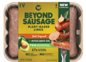
Beyond Beyond Sausage