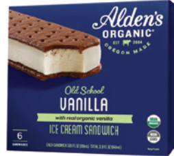
Alden's Organic Organic Ice Cream Sandwiches

Made with organic ingredients and a focus on responsible sourcing, Alden's Organic is a Certified B Corp committed to supporting communities—bringing rich, creamy ice cream to your table while doing things the right way.