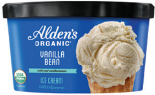
Alden's Organic Organic Ice Cream selected varieties