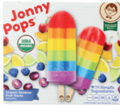
JonnyPops Organic Pops selected varieties