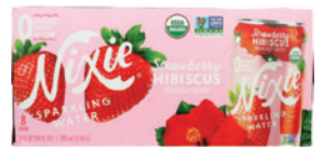
Nixie Organic Sparkling Water selected varieties