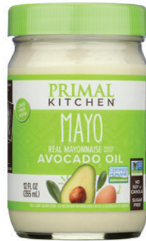
Primal Kitchen Mayo