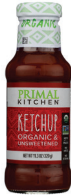
Primal Kitchen Organic Ketchup

Add bold, crave-worthy flavor to the real foods you love with Primal Kitchen Organic Unsweetened Ketchup and Mayo with Avocado Oil. Our premium pantry staples are made with real ingredients like organic California-grown tomatoes and cage-free eggs for a classic taste that kids and parents love. No artificial sweeteners and no nonsense!