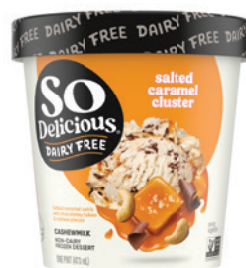
So Delicious Plant-Based Frozen Dessert selected varieties