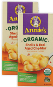
Annie's Organic Mac & Cheese