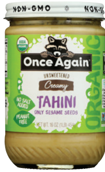
Once Again Organic Tahini

Spreading integrity since 1976, Once Again is a 100% employee-owned company that produces clean ingredient nut & seed butters and snacks. Our passionate employee owners take pride in fueling healthy lifestyles with small-batch, high-quality products crafted as close to homemade as possible.