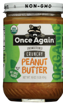
Once Again Organic Peanut Butter