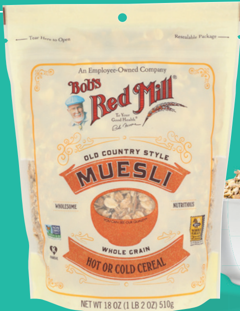
Bob's Red Mill Muesli