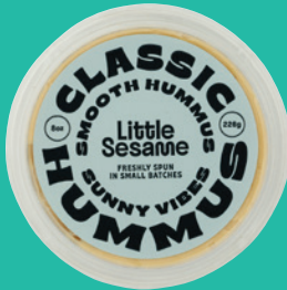
Barnana Organic Plantain Chips