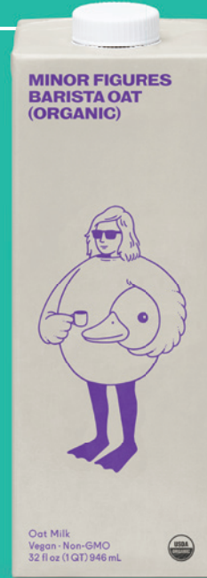
MINOR FIGURES BARISTA OAT (ORGANIC)