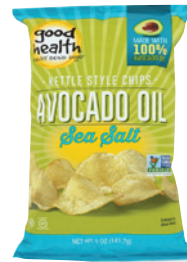
Good Health Avocado Oil Potato Chips selected varieties