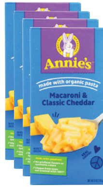
Annie's Mac & Cheese selected varieties

From partnering with the farmers who grow our food, to thoughtfully choosing the packaging that our food is packaged in – we've always had your family and our planet in mind.