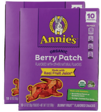
Annie's Organic Fruit Snacks selected varieties