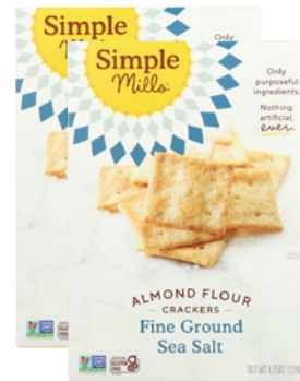
Simple Mills Gluten Free Crackers selected varieties