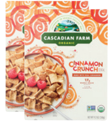
Cascadian Farm Organic Cereal selected varieties