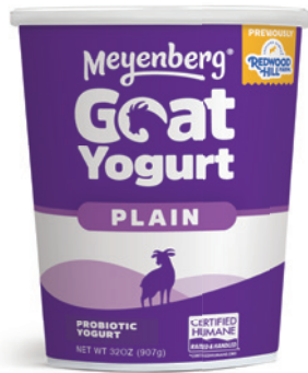
Meyenberg Goat Milk Yogurt selected varieties

Since 1934, Meyenberg has been bringing the goodness of goat milk to people from coast to coast. Our fresh milk and our creamy yogurt are both delicious and easy to digest, as well as being Certified Humane and certified Kosher.