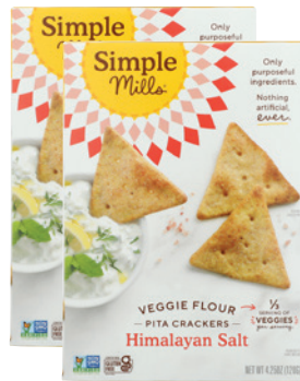
Simple Mills Gluten Free Pita Crackers selected varieties

Simple Mills cookies, crackers, and bars deliver delicious flavor with purposeful ingredients—ideal for summer entertaining, everyday munching, and convenient grab-and-go snacking all month long.