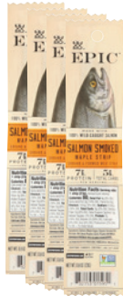
EPIC Snack Strip selected varieties