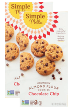
Simple Mills Gluten Free Cookies selected varieties