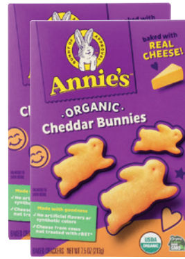
Annie's Organic Bunny Crackers selected varieties