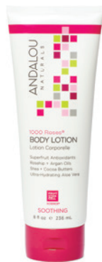
Andalou Naturals Body Lotion selected varieties