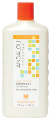
Andalou Naturals Shampoo selected varieties