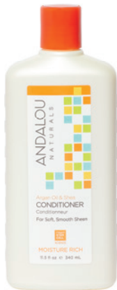
Andalou Naturals Conditioner selected varieties