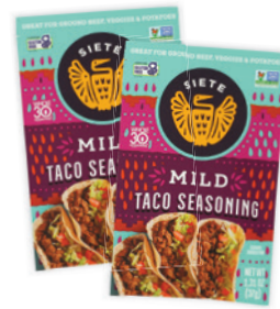
Siete Seasoning selected varieties