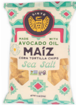
Siete Corn Tortilla Chips selected varieties

Celebrate culture and community gathered around the grill with Siete Foods! Enjoy delicious heritage-inspired foods made with thoughtfully selected ingredients like avocado oil, organic beans, and organic corn. ¡Buen Provecho!