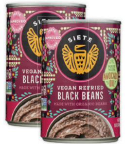
Siete Refried Beans selected varieties