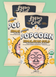
LesserEvil Organic Popcorn selected varieties