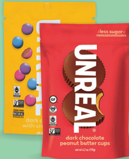
Unreal Chocolate Snacks selected varieties