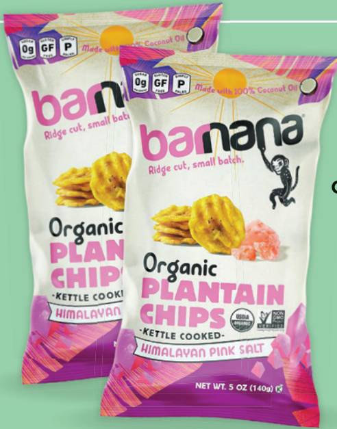
Barnana Organic Plantain Chips selected varieties