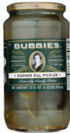
Bubbies Kosher Dill Pickles