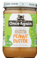
Once Again Organic Peanut Butter selected varieties