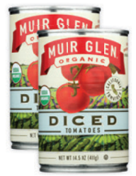
Muir Glen Organic Tomatoes selected varieties