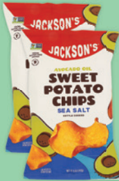
Jackson's Sweet Potato Chips selected varieties