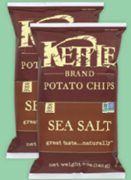
Kettle Potato Chips selected varieties