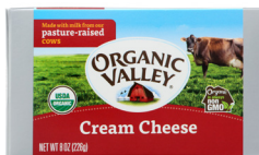
Organic Valley Organic Cream Cheese selected varieties

Bring some small family farm goodness to your spring baking with Organic Valley. All Organic Valley dairy products are made with organic milk from pasture-raised cows for undeniably delicious flavor.