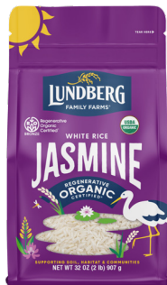
Lundberg Family Farms Organic Rice Pouches selected varieties

Rice-obsessed since 1937. We exist to grow the highest quality rice using organic and regenerative farming practices because the health of our bodies and our planet depend on it.