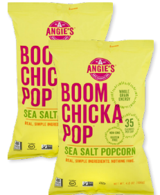
Angie's BoomChickaPop Popcorn selected varieties