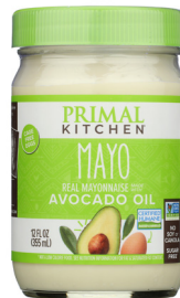
Primal Kitchen Mayo with Avocado Oil selected varieties