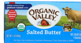
Organic Valley Organic Butter selected varieties