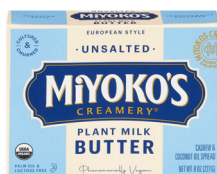
Miyoko's Kitchen Organic Plant Milk Butter