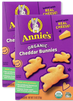
Annie's Organic Bunny Crackers selected varieties

Annie's Promise for Better: a promise to choose nutritious and pantry-worthy ingredients, to add yumminess to every kid's meal, and to use organic ingredients that are forever kind to the planet.