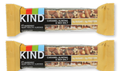
KIND Nut Bar selected varieties