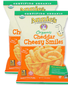
Annie's Organic Cheddar Cheesy Smiles