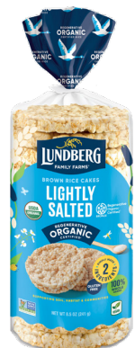
Lundberg Family Farms Organic Rice Cakes selected varieties