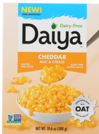
Daiya Deluxe Mac & Cheese selected varieties