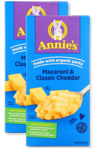
Annie's Mac & Cheese selected varieties