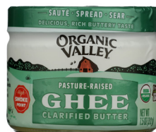
Organic Valley Organic Ghee selected varieties