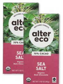
Alter Eco Organic Chocolate Bar selected varieties