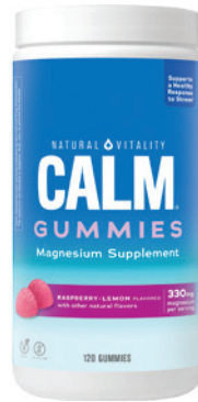
Natural Vitality Calm Gummies selected varieties