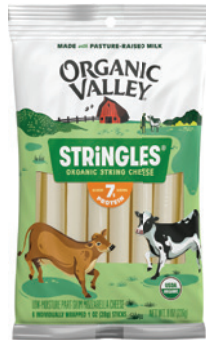
Organic Valley Organic String Cheese