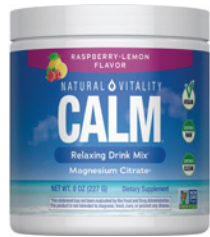
Natural Vitality Natural Calm selected varieties

Natural Vitality magnesium supplements have been a health ally since 1982. With a passion for natural health, we've been designing supplements that support natural vitality for over 40 years.