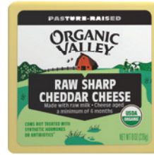
Organic Valley Organic Cheese selected varieties