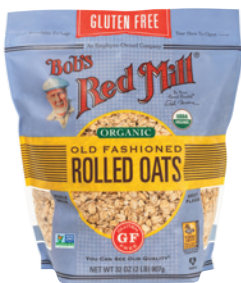
Bob's Red Mill Organic Gluten Free Oats