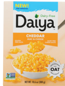
Daiya Deluxe Mac & Cheese selected varieties