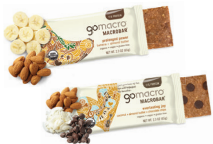
GoMacro Organic MacroBar selected varieties

GoMacro MacroBars®— where high-quality ingredients meet exceptionally delicious flavors! All GoMacro products are certified organic, vegan, gluten-free, kosher, and non-GMO, offering sustained nourishment you can trust and enjoy.