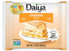
Daiya Dairy-Free Slices selected varieties

Can you imagine a life without cheese? Sounds impossible, right? Now, picture a dairy-free cheese that's irresistibly rich and satisfyingly creamy. With Daiya, it is possible. You'll never have to live without the joy of cheese again.