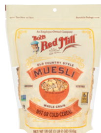
Bob's Red Mill Muesli